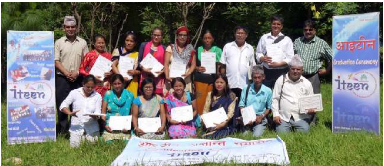
PICTURE AFTER GRADUATION CEREMONY

With the Corona lock down, most of our groups became dis-functional due to the impossibility of meeting together and transporting the materials. But we are glad that we have many video conferencing and online groups now inside the country as well as in the Nepali diaspora.