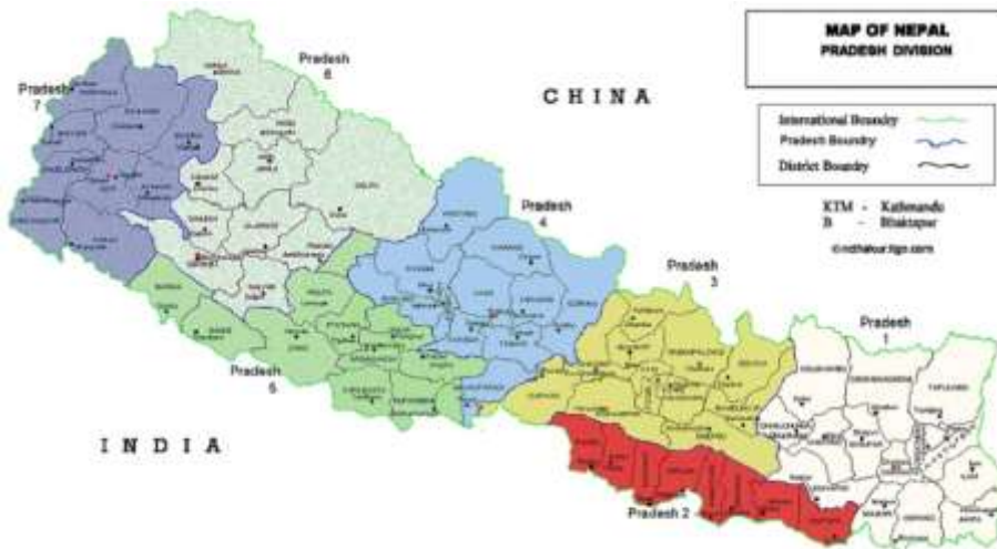
MAP OF NEPAL